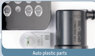
Auto plastic parts