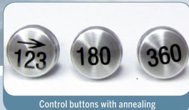
Control buttons with annealing